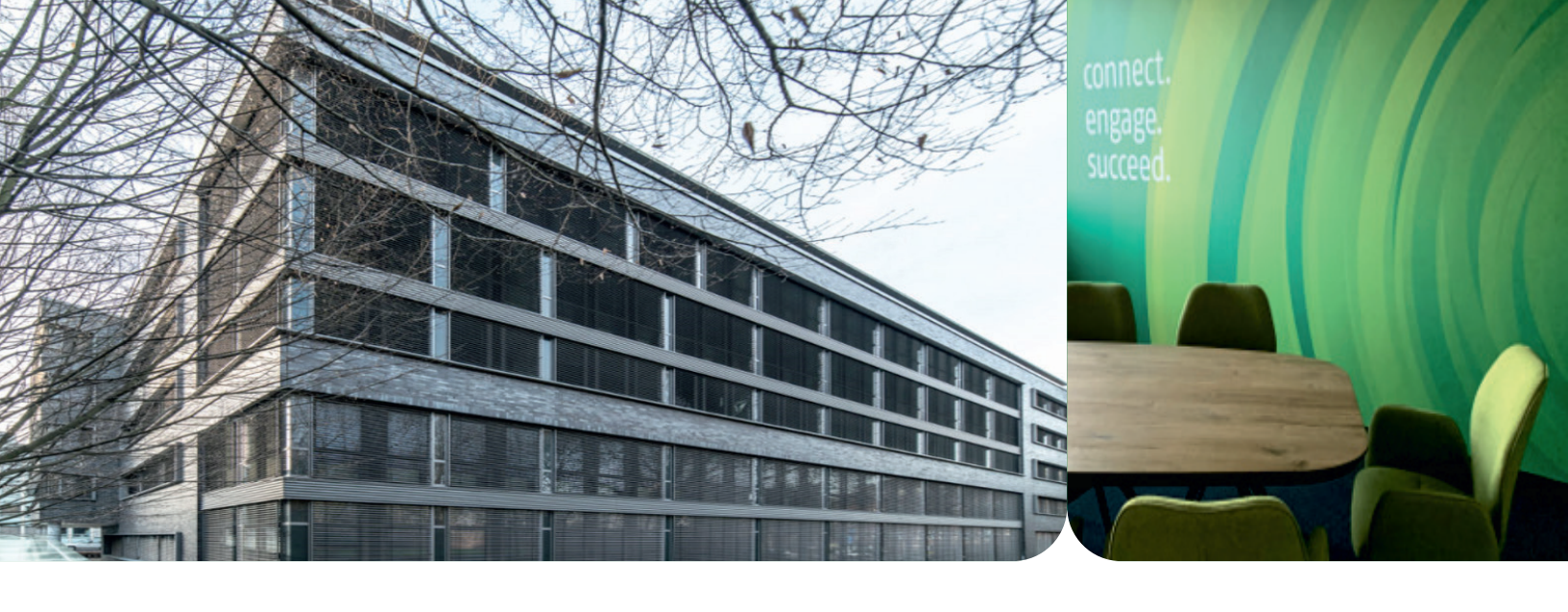
Contacts Your contact person for information, questions and other details: